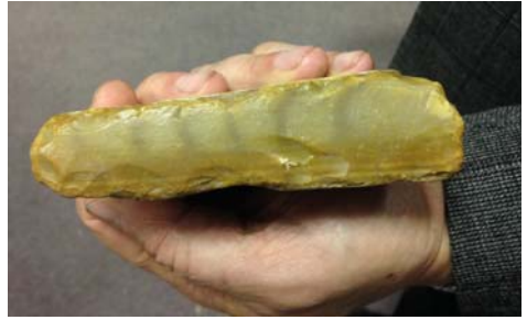
Marshall's rare find; leather scraper!