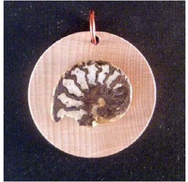
An ammonite jewel!

That decided it! It had to be a day for making ammonite jewelry. Since I am the Shop Foreman AND Paleo Section head, we can do all sorts of stuff in the shops, and we did. Get your hands dirty! We ground the nickel-sized ammonites to reveal the calcite-filled chambers, shined them up, and attached them to wooden disks. A few people drilled the fossils to mount them. A few folks just cleaned them off and left them alone as specimens. This is what they look like.