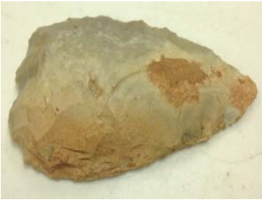
Beautiful Point from Marshall's ranch