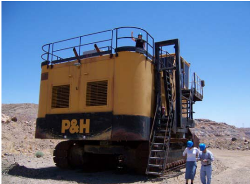
Excavator at Molycorp.